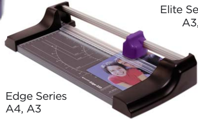
Edge Series A4, A3