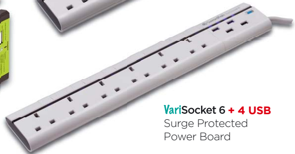
VariSocket 6 + 4 USB Surge Protected Power Board