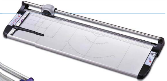
Elite Series A3, A2