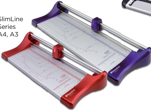
SlimLine Series A4, A3