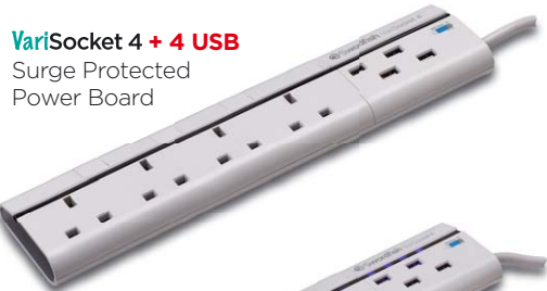
VariSocket 4 + 4 USB Surge Protected Power Board