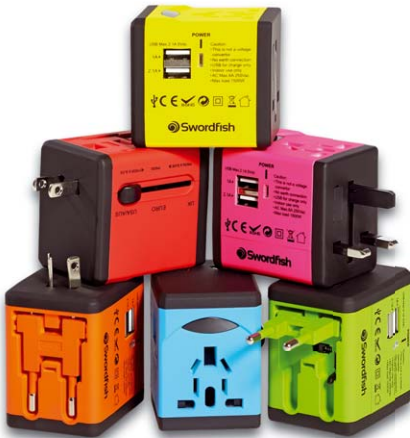
VariPlug Dual USB Universal Travel Adapter