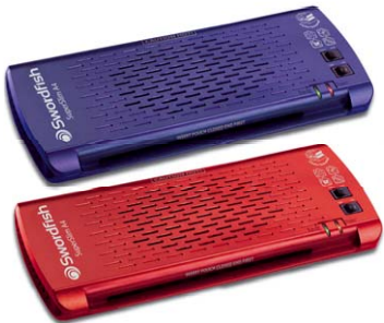
SuperSlim Series A4